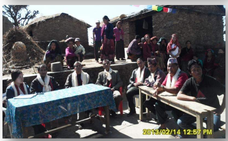
The interaction with the community people at Namki, Gorkha for the operation of Home stay program